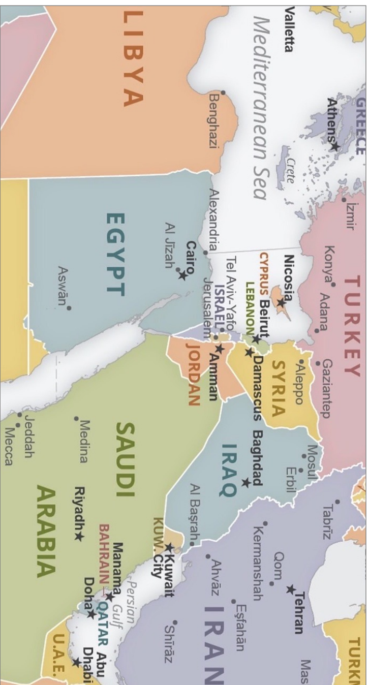
Map 01 - Middle East