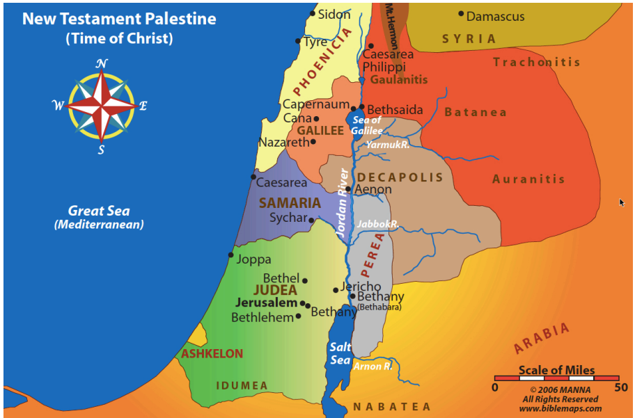
Map 02 - Israel