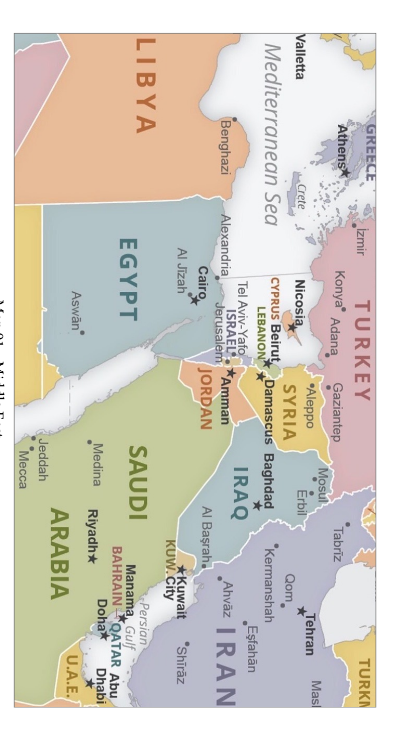
Map 01 - Middle East