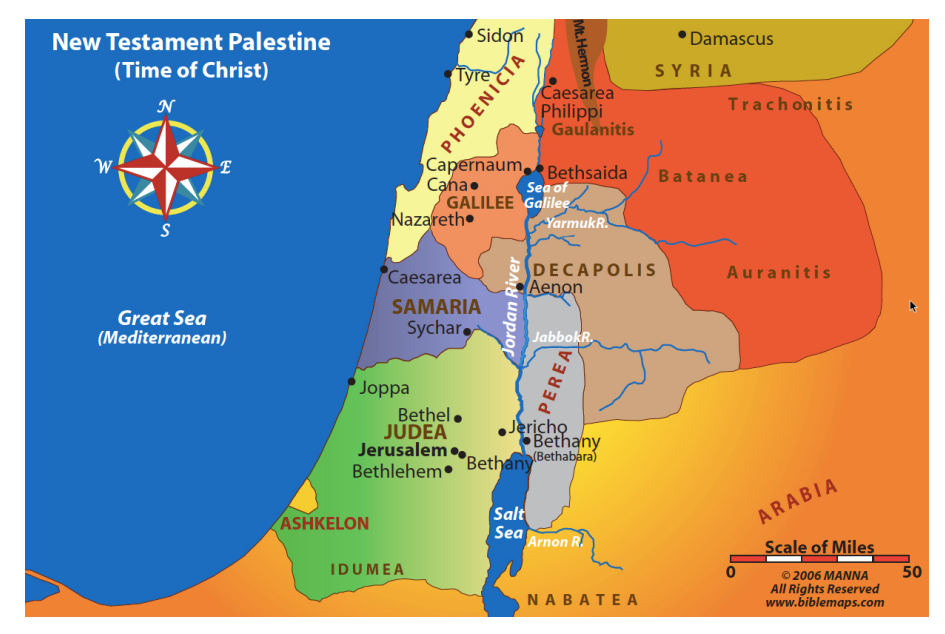
Map 02 - Israel