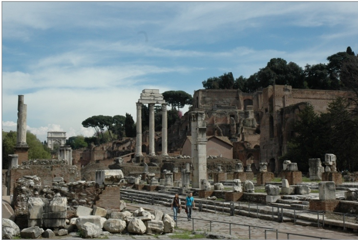
The Roman Forum

The TEMPLE OF VESTA is one of the oldest temples in Rome, although its present appearance dates to 191 AD when it was restored by Julia Domna, wife of Septimius Severus. “The fire sacred to Vesta, the goddess of the household hearth, had to be kept perennially burning in this temple, for the disaster threatened if the flame were to go out.” Associated with the temple was the House of the Vestals, priestesses of the cult and custodians of the fire. There were six women who composed this House, the only body of female priests in Rome.