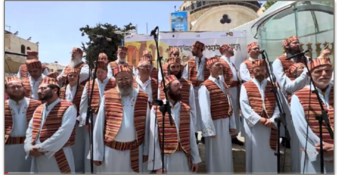
Levites gather in Jerusalem to re-enact their musical role in the Temple.

“Levites Tune up for the Third Temple” is the title of a report in Israel365News for May 3, 2024. Following is an excerpt: “On Thursday, the third intermediary day of Passover, Levites gathered in Jerusalem to reenact their musical role in the Temple. A group of about two dozen Levites gathered in the Old City to practice their singing while wearing garments designed for use by the Temple musicians in the Third Temple. ... The Gaon of Vilna (an 18th-century Torah sage) said that the Temple music would be the last secret to be revealed before the Messiah.” We know from Bible prophecy that the Third Temple will be built, and it will be occupied by the Antichrist, who will declare himself to be God and demand the worship of the entire world (2 Thessalonians 2:3-9; Revelation 13:4-8, 16-17). His entrance into the temple will mark the beginning of the great tribulation (Matthew 24:15-22). The preparations for the Third Temple is a major sign of the times. The hour is very, very late, and if the redeemed saints are going to serve Christ, we must do it now and not allow ourselves to be sidetracked to lesser things.