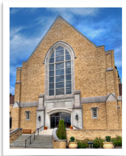
Woodmont Baptist Church, Nashville, TN