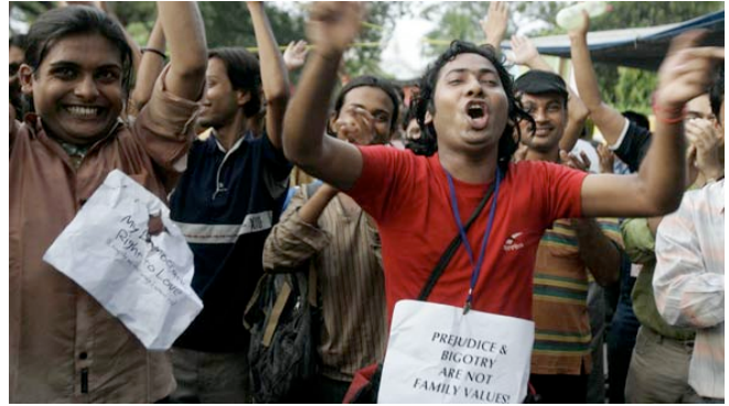
Pro-homosexual protesters wear signs that say "Prejudice and Bigotry are not Family Values"