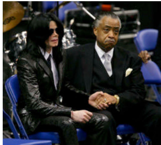
Sharpton and Jackson while Jackson was still alive.