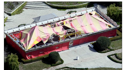
Jackson's Neverland Ranch is in tatters and ruins, having been abandoned in 2005.