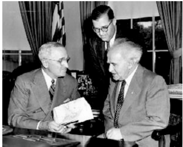
President Truman meeting on May 8, 1951 with Prime Minister David Ben Gurion of Israel and Abba Eban, Israeli Ambassador to the US.

given up the land before you; go in and take possession of the land which the Lord hath sworn unto your fathers, to Abraham, to Isaac, and to Jacob” (“President Truman’s Decision to Recognize Israel,” Jerusalem Center for Public Affairs, May 1, 2008). The new Jewish state was declared at midnight in Jerusalem, May 14, 1948, which was 6:00 P.M. in Washington, and a mere eleven minutes later the White House announced the recognition of the United States.